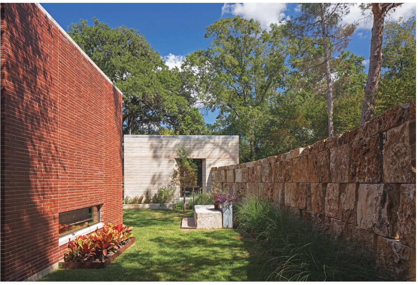
The designer explained that he wanted a wall that offered a lot of privacy and presence so the height was set at 7 feet, 4 inches tall, but he also did not want it to feel too enclosed and confining so the blocks were staggered with the open slits to feel less solid — creating some amazing strips of sunlight at times.

the same time, is astounding. The use of rhythms and interior courtyards, along with the elegant detailing and a complex palette of diverse materials, showed me how all these varied items work in concert to create something greater than the sum of its varied parts and materials.