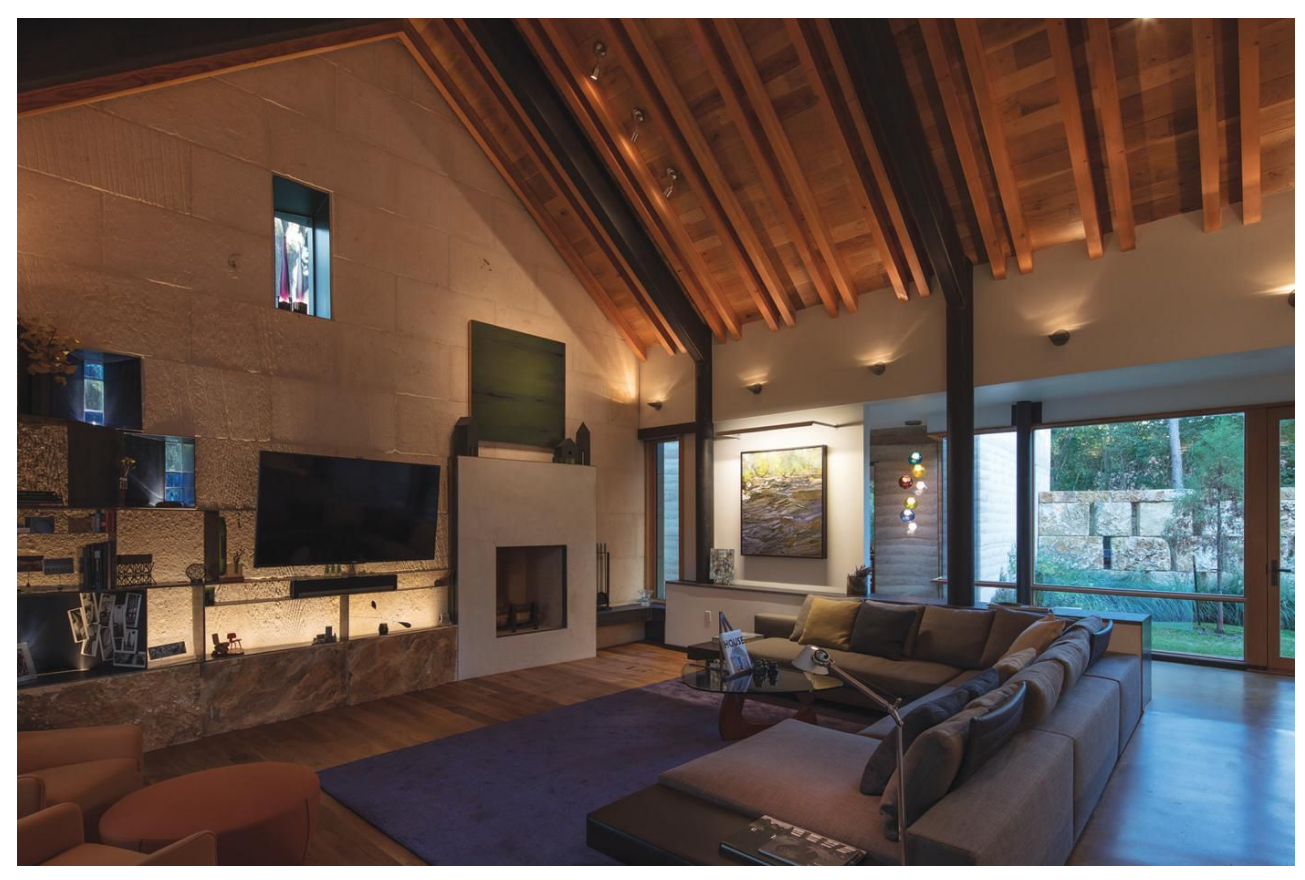
The designer hand-picked which stones went in what location for much of the living room wall to get a better distribution or markings (above). Large glass windows add a nice contrast to the heaviness of the stone blocks (below).