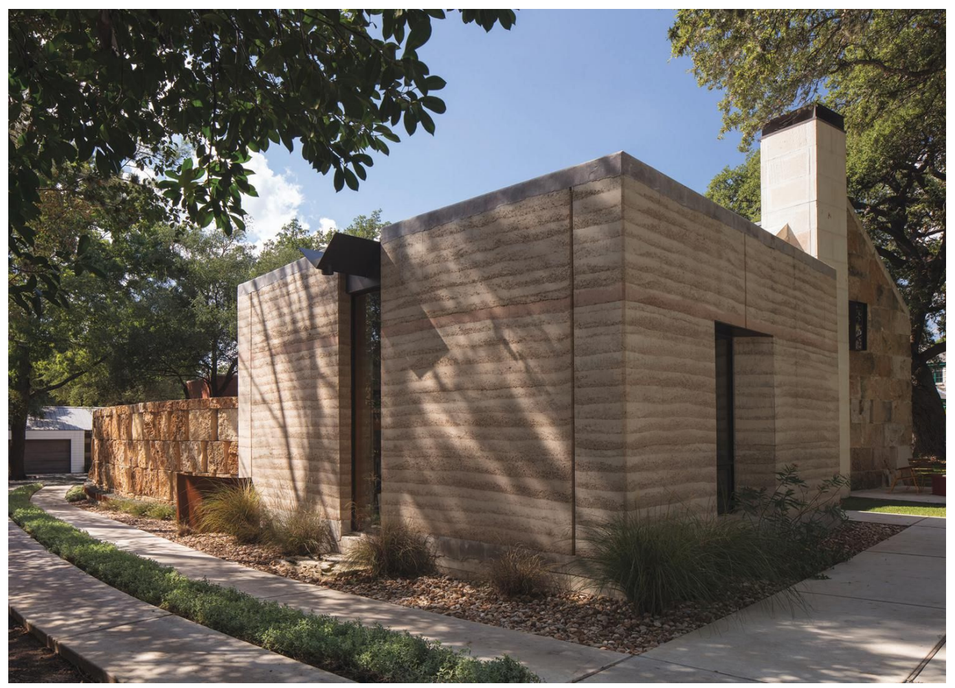
From the start, Harrison planned to use stone for his new home for its strong presence and natural inherent qualities.

the house on the courtyard side. So, you get the amazing effect on two distinctly different areas. I also needed the right thickness to be self-supporting. The stone from Brauer came out of the ground in 12- to 16-inch overall widths, so that size was perfectly suited to my desired configuration. The curve is a response to the driveway, but also a way to make the wall stronger laterally and be able to be only one stone wide.