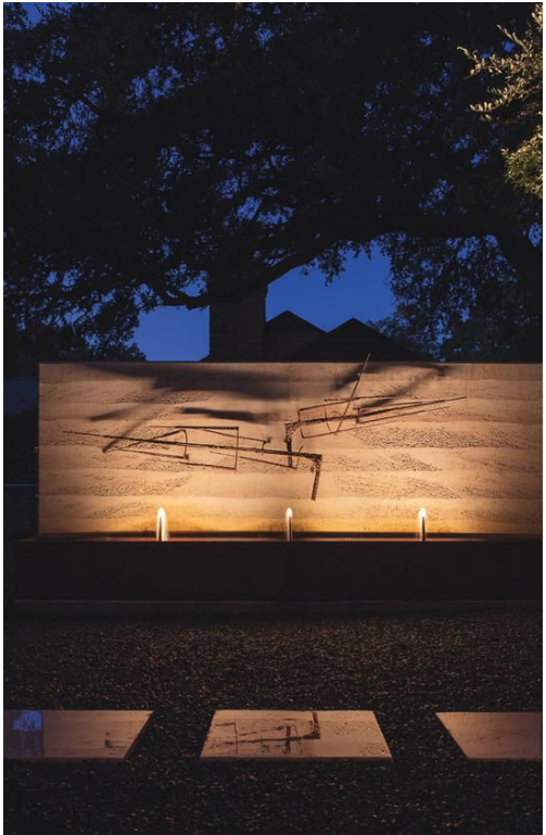
Additionally, a large stone slab creates a stunning fountain in the backyard.

The largest blocks were 22 inches tall x 43 inches long x 6 to 8 inches thick based on the rough surface. Other blocks were exactly half that length and then there were a lot of 8-inch-high cap blocks and a custom-shaped piece to cap the peak of the gable with a single stone.