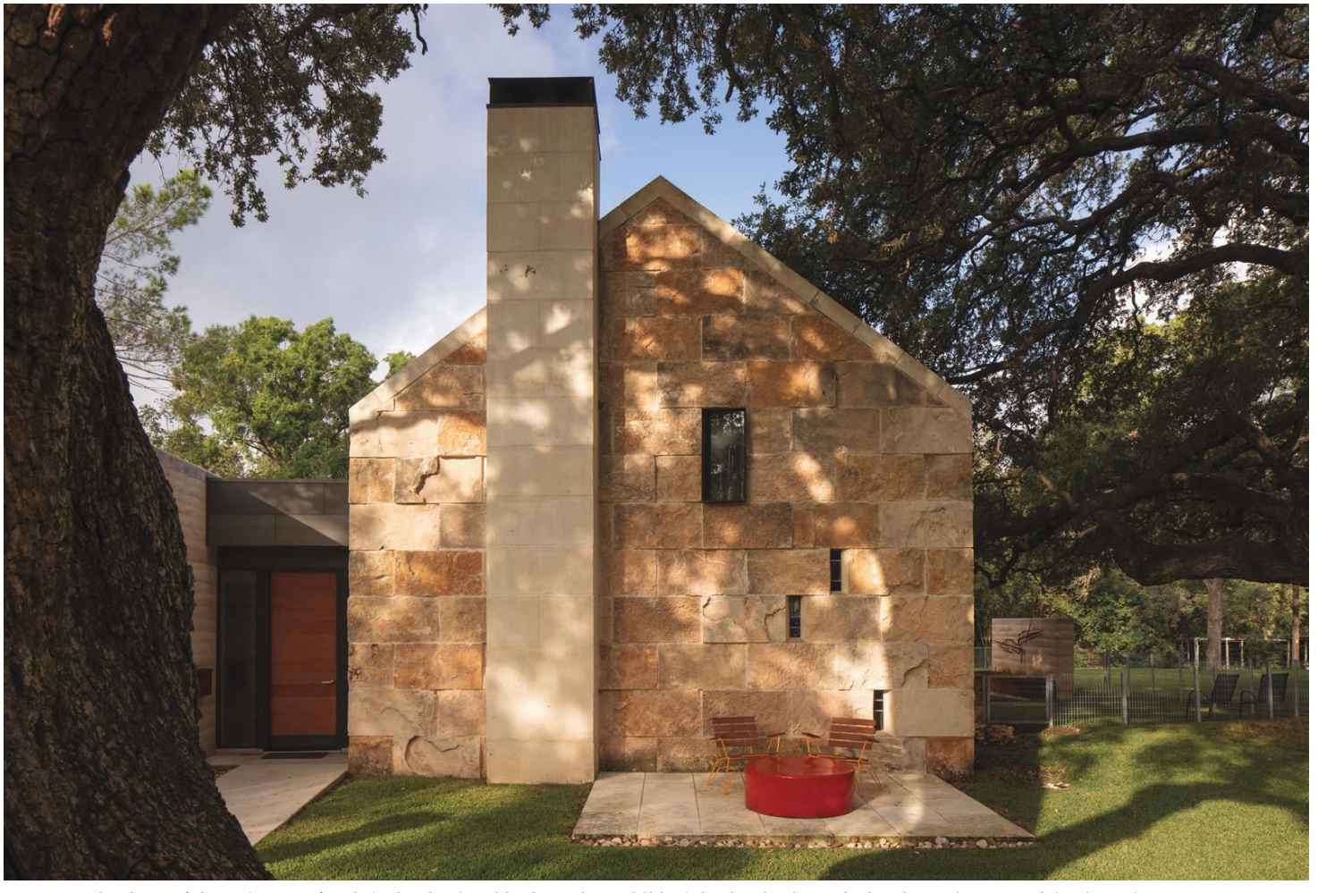
The shape of the main stone facade is the classic gable shape that a child might sketch when asked to draw a house, explained Harrison. "I am drawn to iconic shapes that present a clear illustration of the spaces contained within," he said.

knew a lot of information before going, but in each case, I was confirming selections and availability, etc. I also met with the quarry owners to discuss their individual capabilities as far as size limitations and cutting techniques, and I looked around the quarries to see color and texture variations each one offered.